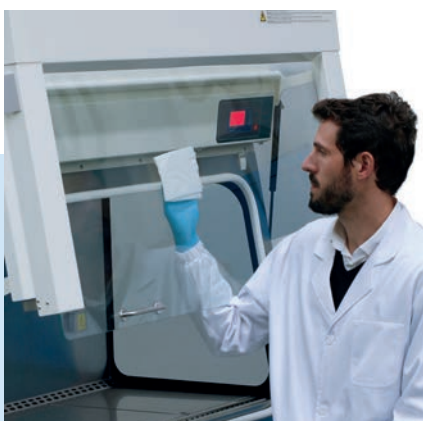
Easy cleaning of the inside window.

The Bio II Advance Plus has a colour screen which enables easy and quick viewing of the safety parameters. The visual display shows the level of filter clogging, which is extremely useful for optimising the service. The display also shows laminar speed flow to control the cabinet's status at all times.